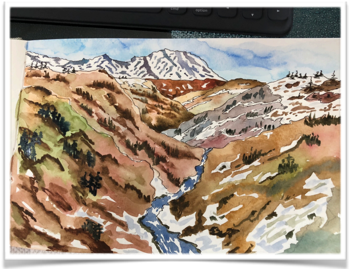
View from the train, Alaska