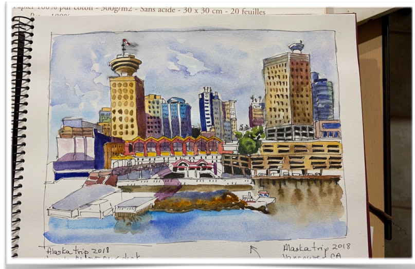
Sketch of downtown Vancouver, Canada. See page 7 for fuller descriptions.