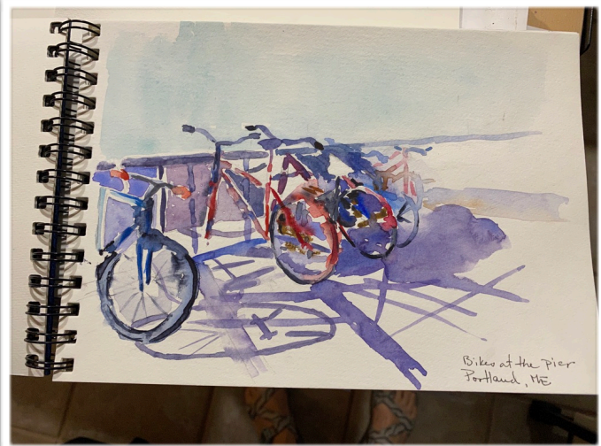
Bicycles at the port in Portland, ME

Not being able to hold the workshops is not devastating as are the health and financial issues so many families are facing.