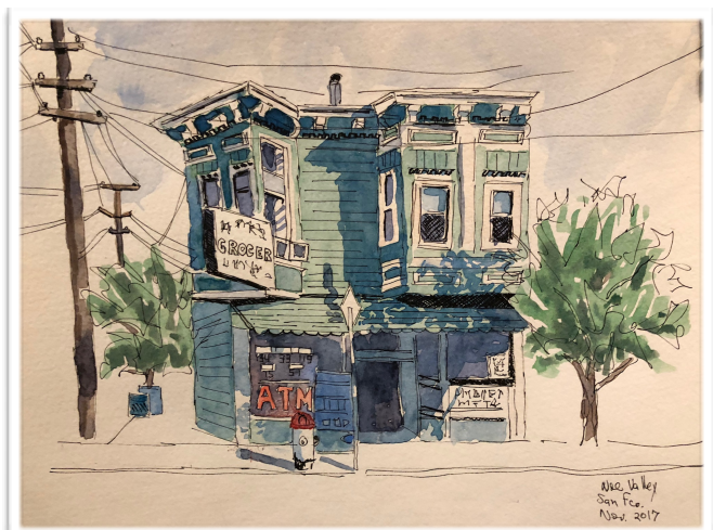
Fruit market, San Francisco, CA