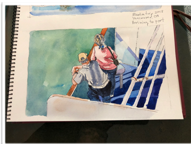
Looking at the glacier from cruise ship, Alaska

I try to sketch on location but sometimes finish them at home or a hotel if I am traveling. I do take a photo of the subject before I start in case I want to finish it later and to make sure I capture the shadows just as they were when I started.