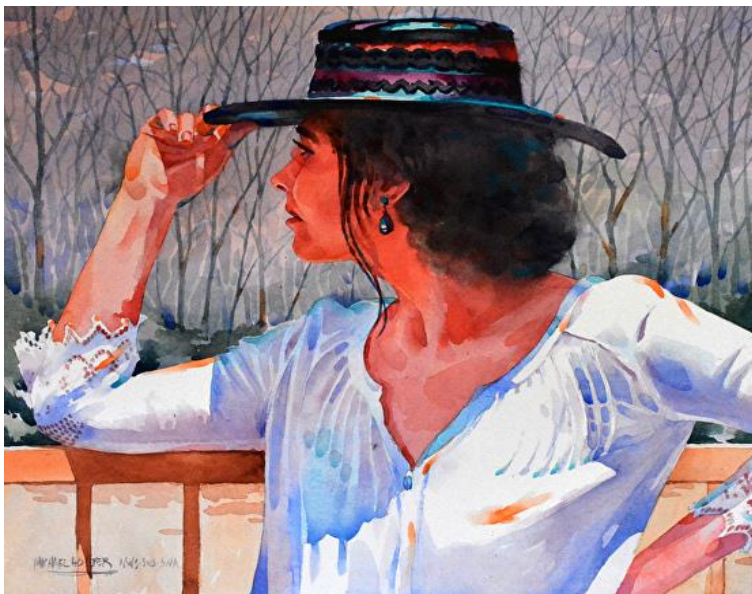
Watercolor Impressionism: Faces and Places Sept. 13,14,15 2021

For more information on the workshops visit www.michaelholter.com .