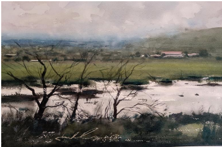
Examples of Frank Eber Paintings from to September workshop