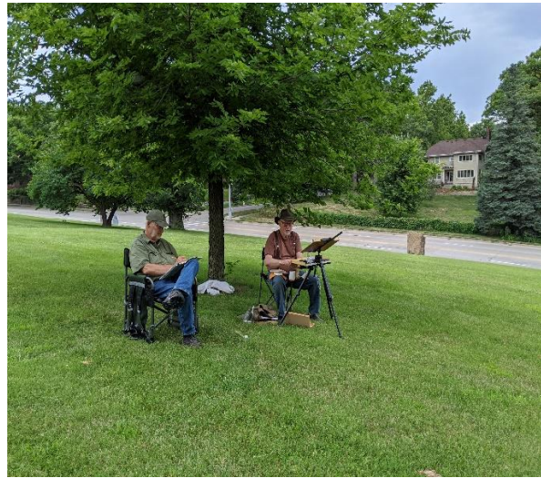
Plein Air at the Des Moines Art Center