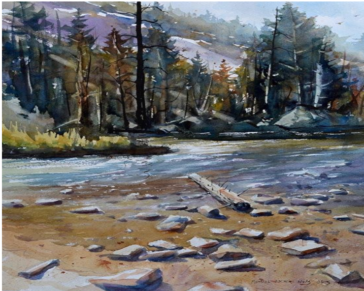
Watercolor Impressionism: Landscape Cityscape Sept 8,9,10 2021